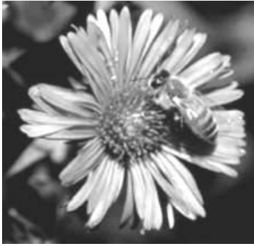
honey bee on aster (#8931, ESA Ries Memorial Slide Collection).

anceled uses represent 90% of the dietary risk to children. Removing these crop uses brings the estimated dietary risk down to 78% of the reference dose, making the risk from food acceptable for children and all others in the U.S. population.