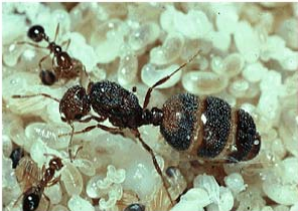
Ant queen with workers, larvae and eggs.

Life cycle. Ants are social insects. They live in colonies in which one or more queens produce eggs. The eggs hatch after a few days into small larvae that are cared for by workers. After a few weeks the larvae