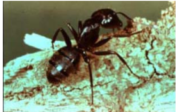
Large Carpenter Ant Worker

An older, established colony will produce winged males and females that will fly out to begin new colonies. These are called alates. This is the same term used to described termites with wings. The alate females can be quite large, measuring up to 3/4 inch, while the males are generally less than 1/2 inch. This usually occurs in the late spring or early summer.