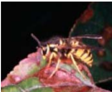
A yellow jacket. Note the lack of pollen baskets.

Identification: The yellow jacket worker is about ½ inch in length with alternating yellow and black bands on the abdomen. Foraging yellow jackets are often mistaken for honey bees because of their similar color and the fact that they may be attracted to the same food sources. Honey bees are slightly larger than yellow jackets and are covered with hairs or setae that are absent on yellow jackets. Foraging honey bees can be identified by the pollen baskets on the rear legs that are often loaded with a ball of yellow or green pollen. The yellow jacket has a smooth stinger that can be used to sting multiple times. Honey bees have a barbed stinger that can be used to sting only once.