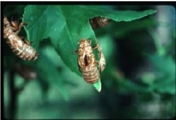
Figure 4. Empty nymphal skins attached to tree leaves.