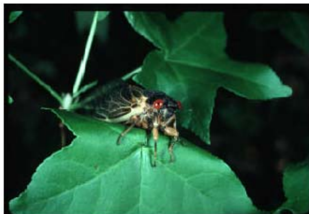
Figure 2. A 13-year periodical cicada showing the distinct eyes and leg color.

wing veins are a reddish orange color (Fig. 2.). The wingless immature cicada (nymph) emerges from the soil at night, climbs a tree trunk or other vertical surface and sheds its skin (Fig 3.). A new winged adult leaves the hard, empty shell behind (Fig. 4.). By morning the wings have expanded and hardened and the cicada is free to move about. As many as 20,000 to 40,000 cicadas may emerge from the soil beneath one large tree.