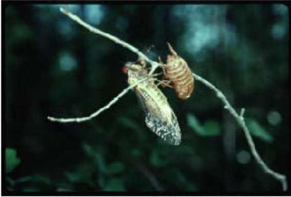
Figure 3. A newly emerged adult resting by the empty nymphal skin.