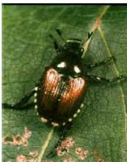
Figure 1. Adult Japanese beetle.

The adult Japanese beetle (Figure 1) is a brightly colored oval insect about \frac{1}{3} to \frac{1}{2} inch long. The body and legs are a bright metallic green while the elytra (wing covers) are coppery brown. The Japanese beetle is distinguished from any other beetles with similar coloration by the white spots or tufts, five on each side and a pair at the tip of the abdomen. Females are slightly larger than the males. The larva (grub) (Figure 2.) is about \frac{3}{4} to 1 inch long when mature and usually takes on a crescent shape when exposed. It is grayish white with a yellowish brown head. The larvae can be distinguished from other "white grubs" by a V-shaped row of spines on the underside of the last segment of the body (Figure 3).