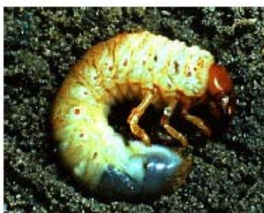
Figure 2. White grub.