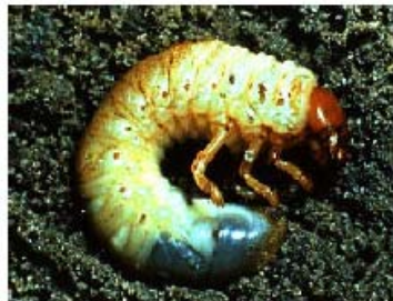
Figure 1. A typical white grub.

White grubs are the larval (immature) stage of several different beetles. Most of the grubs will assume a “C” shape when they are dug out of the soil (Fig. 1). They have a well-developed brownish head and three pairs of well-developed legs. With one exception, the grubs feed on the roots of warm and cool-season grasses. They show no preference for home lawns, golf courses, sports turf, or industrial landscape. All