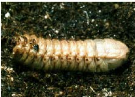
Figure 3. A green June beetle grub.

Green June beetles have a one year life cycle (Fig. 2). Adults are present from mid to late June through early August. Eggs are laid in the upper soil layer. The egg and first two grub stages are quite short. By the end of August, nearly all the grubs will be in the third instar. Mature grubs are two inches long. The grubs differ from the other white grubs. Green June beetles have short legs, there are short, stiff bristles on the back, they usually lie on their back in an extended position and rarely assume a “C” shape (Fig 3), and they feed primarily on decaying organic matter instead of turfgrass roots. The young grubs construct horizontal tunnels in the top two inches of the soil, while third-instar grubs construct vertical tunnels in the soil and come to the surface at night to feed. The tunneling can disrupt the root system and under drought conditions can cause the turfgrass to die out. Piles of soil are pushed up at the entrance to the tunnel. This can be unsightly, damage reel type lawn mowers, and disrupt golf play. While feeding on the surface, the grubs may move around considerably. Often they are found on paved areas in the early morning or trapped in the gutters where curbs and gutters are present on streets. If the grubs become trapped on the hot pavement, they die and smell bad as they decay.